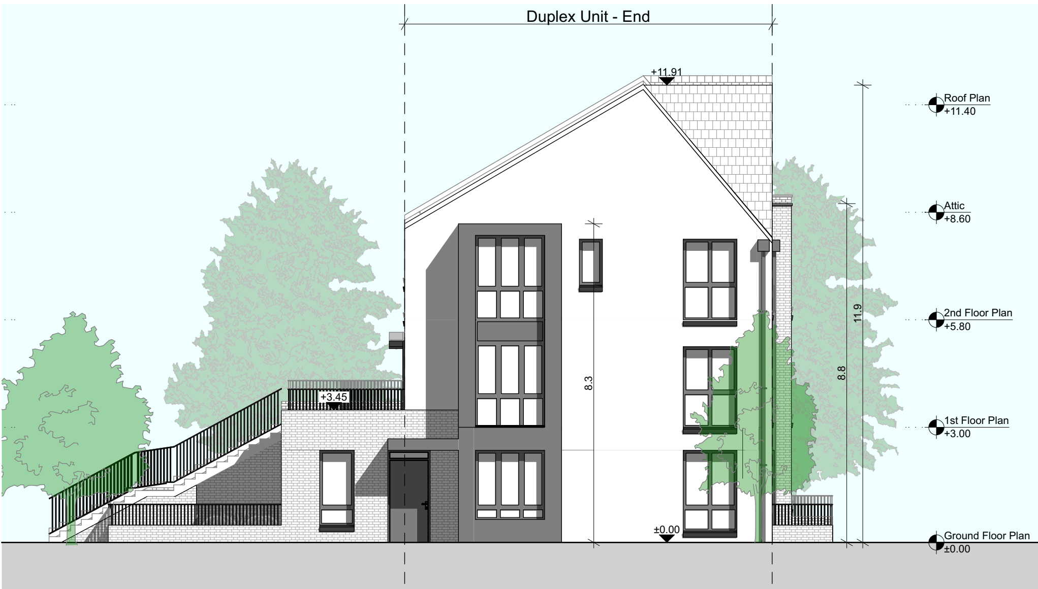
SIDE ELEVATION 01 SCALE 1:100