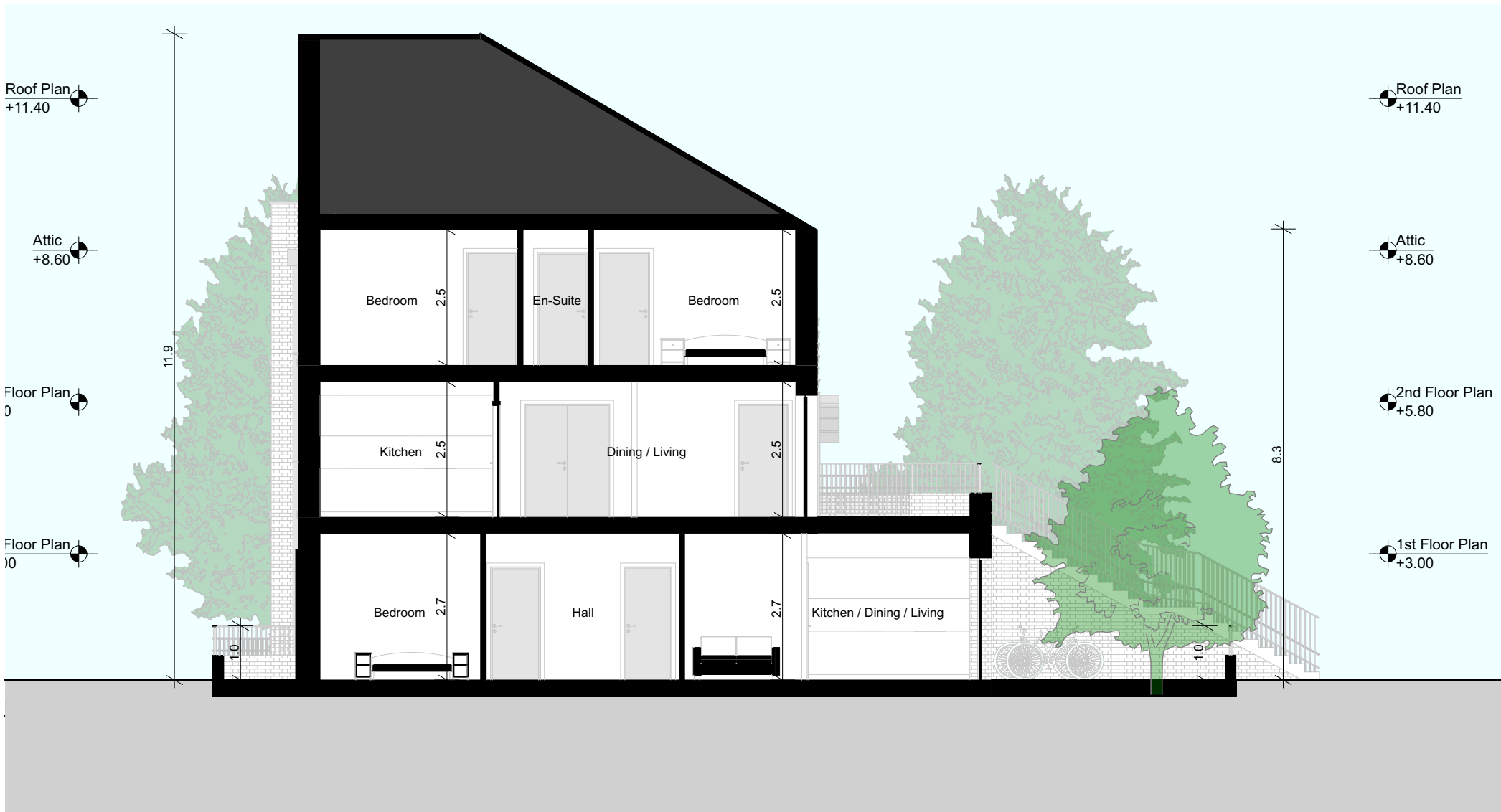
SECTION 01 SCALE 1:100